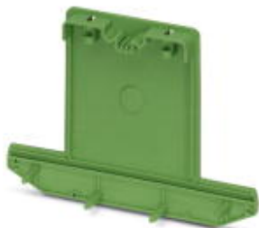
Side element, tall version, for closing both ends of the base element UM-BEFE, for 60 mm wide U-shaped profile cover

Please be informed that the data shown in this PDF Document is generated from our Online Catalog. Please find the complete data in the user's documentation. Our General Terms of Use for Downloads are valid ( http://phoenixcontact.com/download )