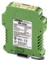
Analog extension module with 4 analog current outputs 4 mA ... 20mA

Please be informed that the data shown in this PDF Document is generated from our Online Catalog. Please find the complete data in the user's documentation. Our General Terms of Use for Downloads are valid ( http://phoenixcontact.com/download )