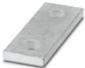
Connection rail, number of positions: 2, color: silver