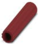
Insulating sleeve, color: red