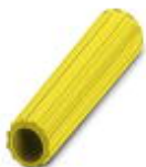
Insulating sleeve, color: yellow