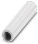
Insulating sleeve, color: white