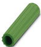
Insulating sleeve, color: green