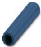
Insulating sleeve, color: blue