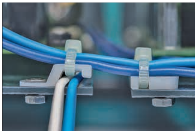
TY- (l) and MB-Series (r) with curved design, screwable.