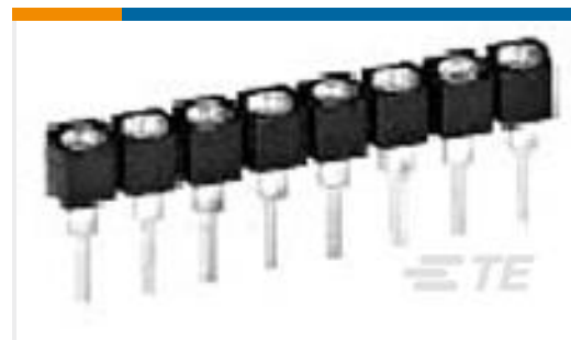
TE Model / Part #6-1437535-6 510AG91D10ESL=SOCKET ASSY