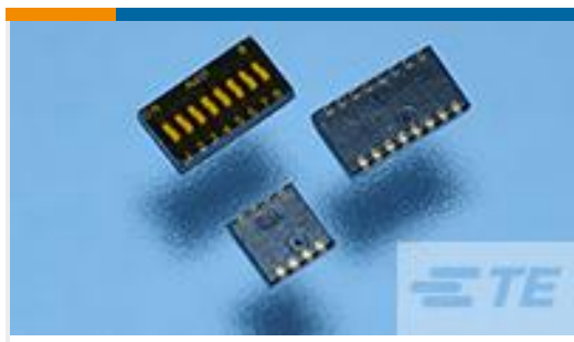
TE Model / Part #1977831-4 DIP SWITCH GDH08SATR04