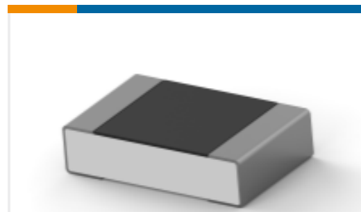
TE Model / Part #7-2176374-2 RQ 0805 590R 0.1% 10PPM 1K RL