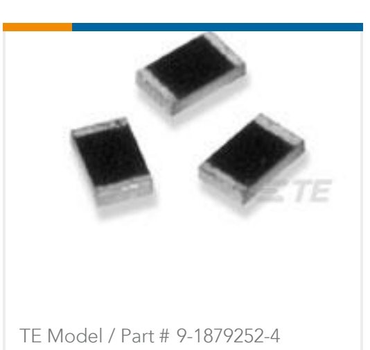
RP 2B 10R 0.1% 15PPM CUT LENGTH