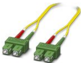
Single-mode OS2 duplex jumper, SC-SC, APC polishing, length 5 m

Please be informed that the data shown in this PDF Document is generated from our Online Catalog. Please find the complete data in the user's documentation. Our General Terms of Use for Downloads are valid ( http://phoenixcontact.com/download )