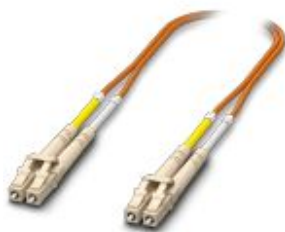
Multi-mode OM2 duplex jumper, LC-LC, UPC polishing, length 5 m

Please be informed that the data shown in this PDF Document is generated from our Online Catalog. Please find the complete data in the user's documentation. Our General Terms of Use for Downloads are valid ( http://phoenixcontact.com/download )