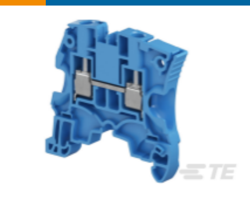
TE Model / Part # 1SNK510020R0000 ZS16-BL