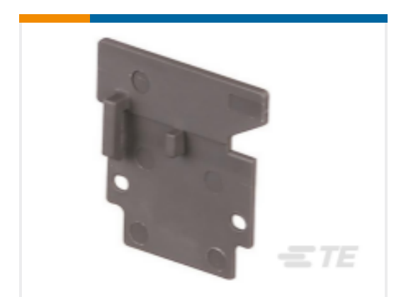
TE Model / Part # 1SNK900101R0000 CS