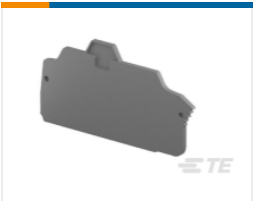
TE Model / Part #1SNK710910R0000 EK10