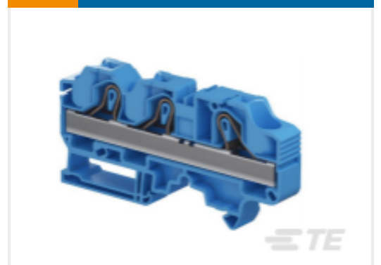
TE Model / Part # 1SNK710020R0000 ZK10-BL