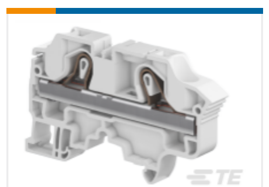
TE Model / Part # 1SNK710030R0000 ZK10-OR