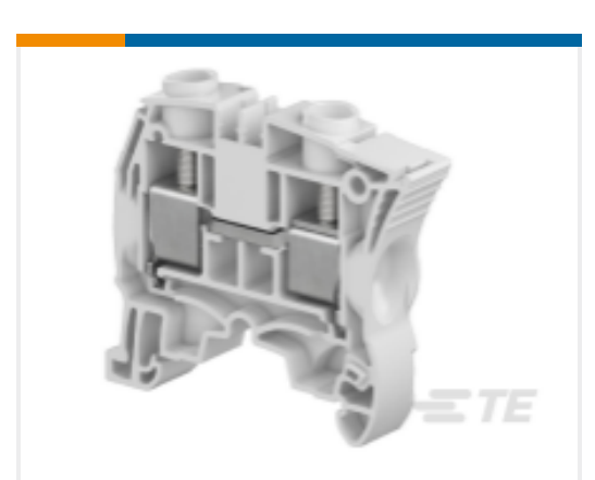
TE Model / Part # 1SNK510030R0000 ZS16-OR