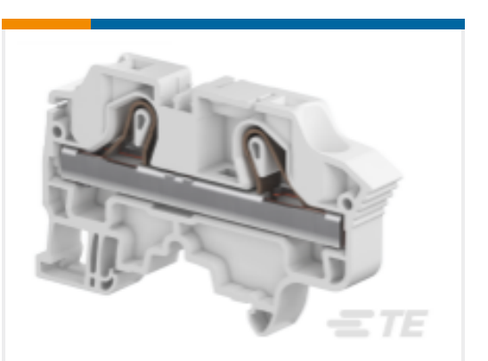
TE Model / Part # 1SNK710010R0000 ZK10