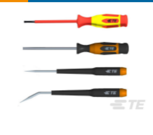
TE Model / Part # 1SNK900659R0000 TO3.5-50-A