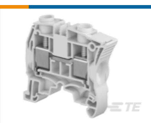
TE Model / Part # 1SNK510010R0000 ZS16