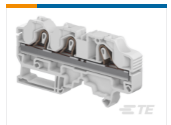
TE Model / Part # 1SNK710011R0000 ZK10-3P