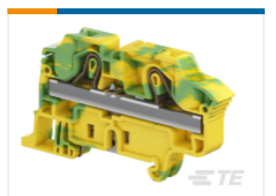
TE Model / Part # 1SNK710150R0000 ZK10-PE