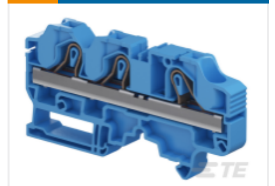
TE Model / Part # 1SNK710021R0000 ZK10-3P-BL