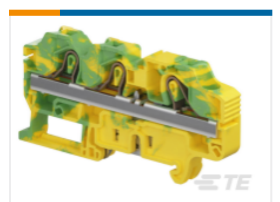
TE Model / Part # 1SNK710151R0000 ZK10-PE-3P