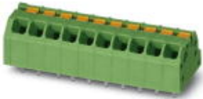
The figure shows 10-pos. standard item (without EX marking)

PCB terminal block, nominal current: 16 A, nominal cross section: 1.5 mm 2 , pitch: 3.5 mm, number of positions: 9, connection method: Push-in spring connection, mounting: Wave soldering, conductor/PCB connection direction: 45 °, color: green, Pin layout: Linear pinning, Solder pin [P]: 2.6 mm