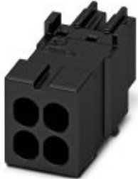
Accessories, number of positions: 4, pitch: 2.54 mm, color: black

Please be informed that the data shown in this PDF Document is generated from our Online Catalog. Please find the complete data in the user's documentation. Our General Terms of Use for Downloads are valid ( http://phoenixcontact.com/download )