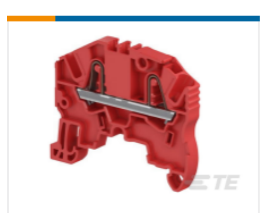
TE Model / Part #1SNK705062R0000 ZK2.5-RD