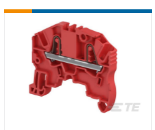
TE Model / Part #1SNK705062R0000 ZK2.5-RD