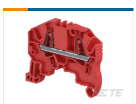
TE Model / Part #1SNK705062R0000 ZK2.5-RD