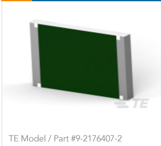
3560 56R 5%