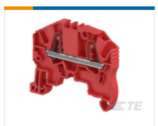
TE Model / Part #1SNK705062R0000 ZK2.5-RD