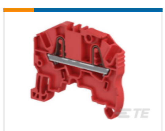
TE Model / Part #1SNK705062R0000 ZK2.5-RD