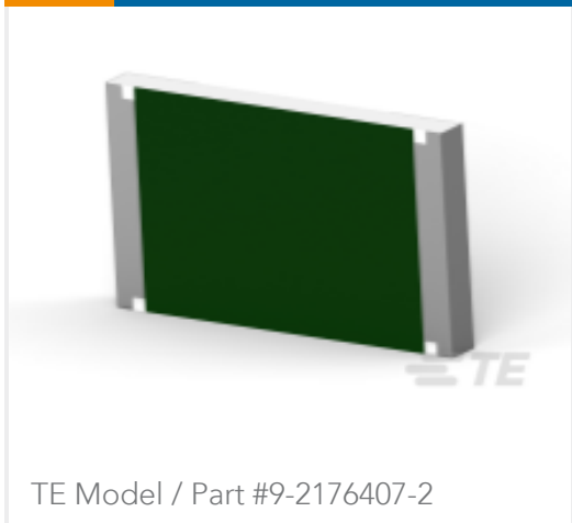
3560 56R 5%