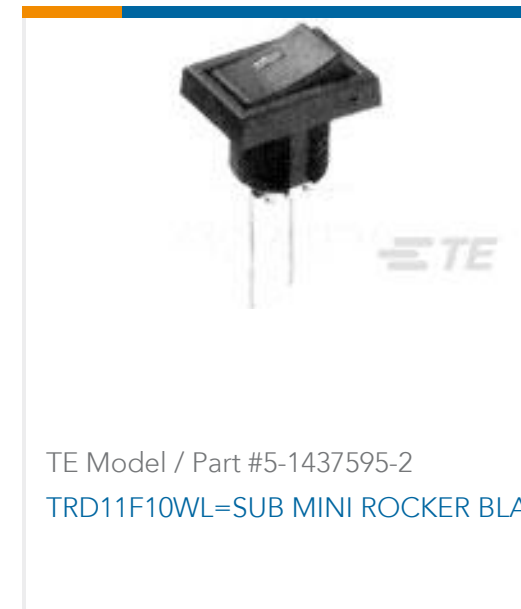
TE Model / Part #5-1437595-2 TRD11F10WL=SUB MINI ROCKER BLA