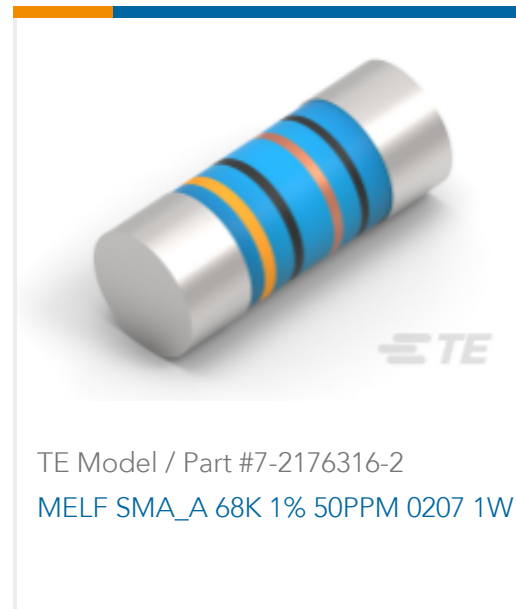
TE Model / Part #7-2176316-2 MELF SMA_A 68K 1% 50PPM 0207 1W