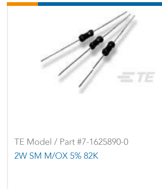
TE Model / Part #7-1625890-0 2W SM M/OX 5% 82K