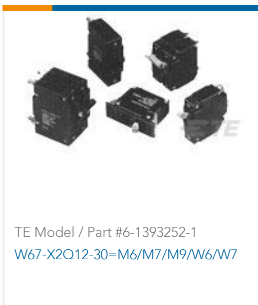
TE Model / Part #6-1393252-1 W67-X2Q12-30=M6/M7/M9/W6/W7