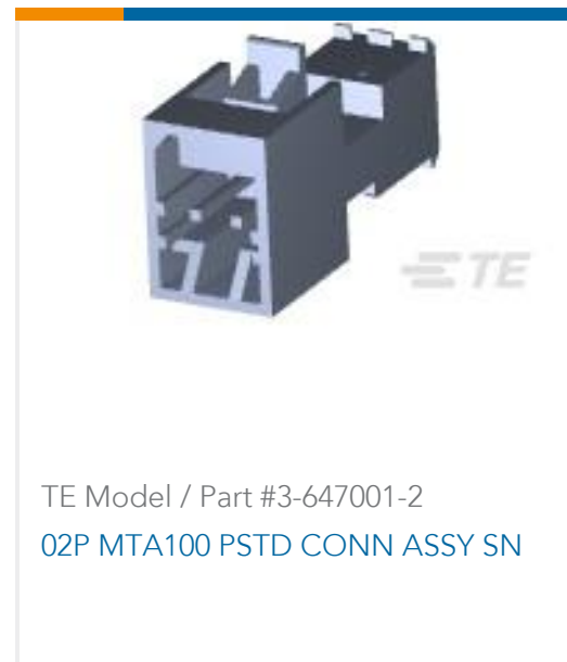
TE Model / Part #3-647001-2 02P MTA100 PSTD CONN ASSY SN