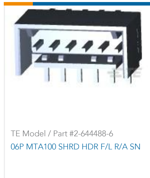
TE Model / Part #2-644488-6 06P MTA100 SHRD HDR F/L R/A SN