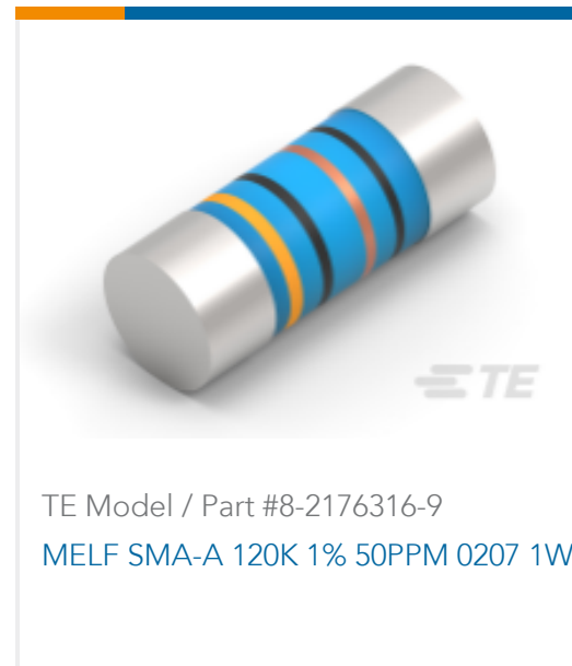
TE Model / Part #8-2176316-9 MELF SMA-A 120K 1% 50PPM 0207 1W