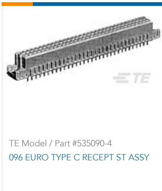
TE Model / Part #535090-4 096 EURO TYPE C RECEPT ST ASSY