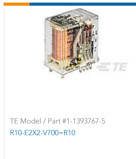
TE Model / Part #1-1393767-5 R10-E2X2-V700=R10