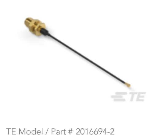
RF CA,SMA BULKHEAD TO UMCC IV, L100MM