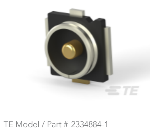
UMCC Micro-Coax receptacle, Gen 4