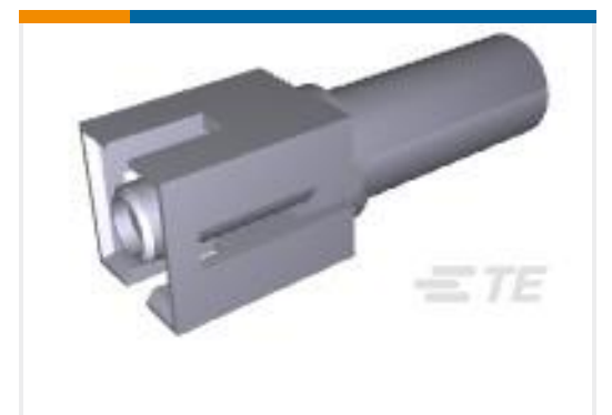
TE Model / Part #926472-1 UNIV.M-N.L.CAP S.C.