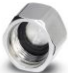
M12 metal sealing cap for unoccupied M12 plugs of the sensor/actuator cable, flush-type plugs and I/O devices in the field