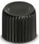
M12 sealing cap for unoccupied M12 plugs of the sensor/actuator cable, flush-type plugs and I/O devices in the field