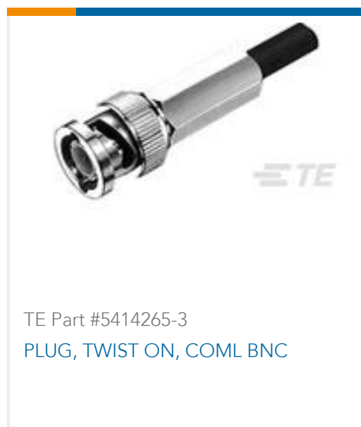
TE Part #5414265-3 PLUG, TWIST ON, COML BNC