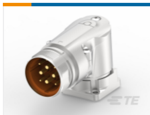
TE Part # CGE270N00000020000 940 RECEPTACLE ANGLED, ROTATABLE,SPEEDTEC