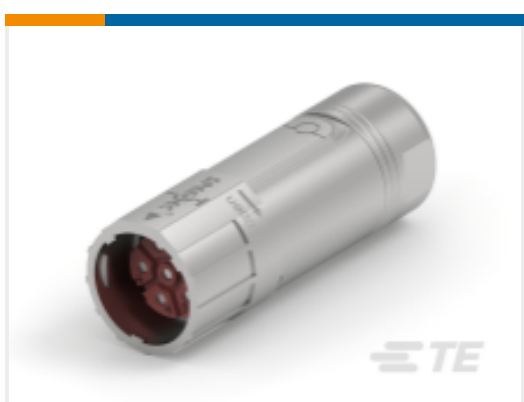
TE Part #BSA085N00550100000 923 PLUG, SPEEDTEC