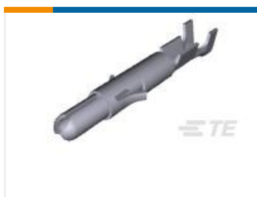
TE Part #350699-1 UMNL SPLIT PIN PTPBR