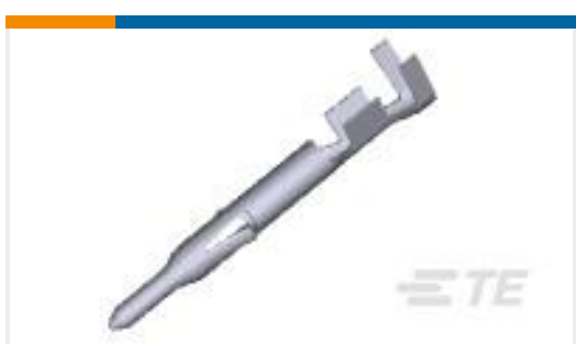
TE Part #770985-3 MINI UMNL PIN 26-22AWG AU LP