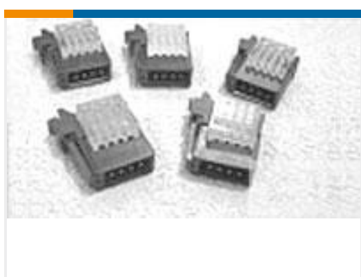
TE Part #1473562-4 RITS CONN. PLUG ASSY 4P YELLOW