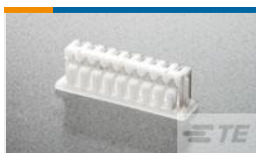
TE Part #440146-5 1.25mm WTB Socket,Housing,5p