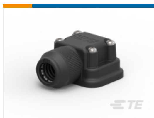
TE Part #2174053-1 ENC. CBL I/O KIT, M-MOTOR PLUS