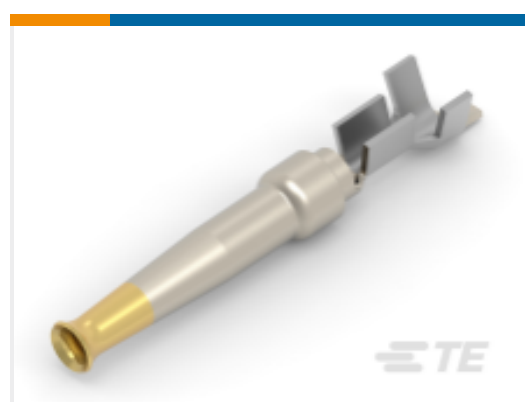
TE Part #1658542-2 D-Sub Conn Contacts: Socket, Phosphor Bronze, Signal, Size 20