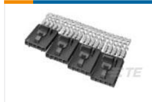
TE Part #1-103641-9 20 MTE RCPT SR LATCH .100CL