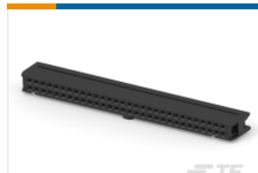
TE Part #6-2271035-0 EJT2.54, IDC SKT, 2x30P, FG