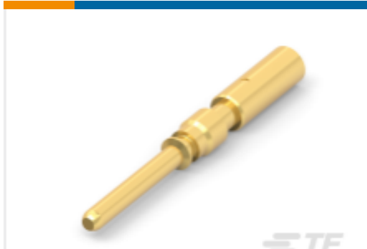
TE Part #61-0197-011-000 CONTACT PIN 2 MM