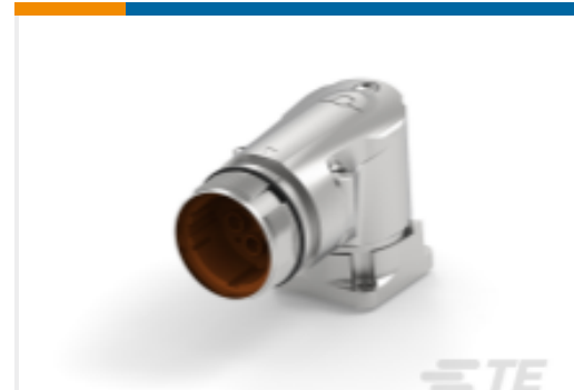
TE Part #CGE271N00000051000 940 RECEPTACLE ANGLED, ROTATABLE, SP-READY