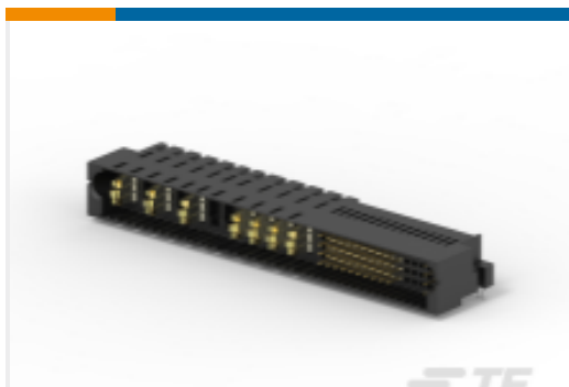
TE Part #3-6450832-3 MBXLE R/A HEADER 5P+2HDP+4P+64S