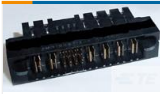
TE Part #1892301-1 MBXL R/A HDR DB 12S+11P