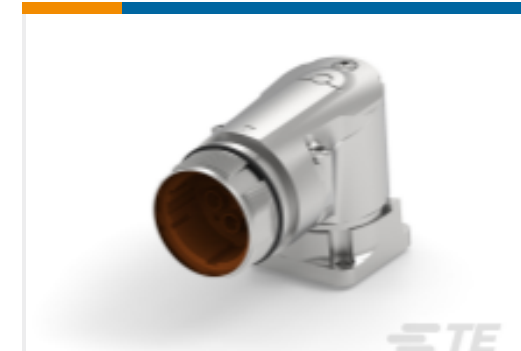
TE Part #CGE271N00000091000 940 RECEPTACLE ANGLED, ROTATABLE, SP-READY