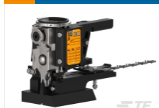
TE Part #2-2150713-1 OC-PA-E-FM-090F140F-001-0051