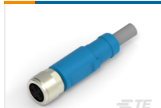
TE Part #T4051320003-007 M8 FEMALE STRAIGHT SINGLE END CABLE ASSY