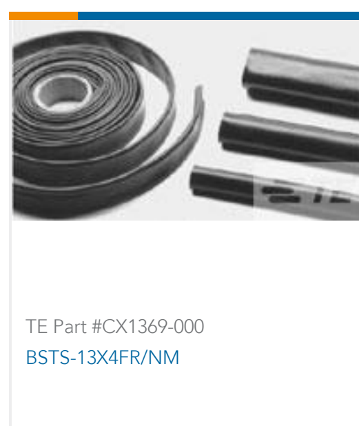
TE Part #CX1369-000 BSTS-13X4FR/NM