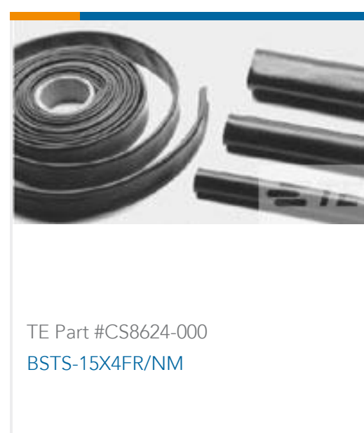
TE Part #CS8624-000 BSTS-15X4FR/NM