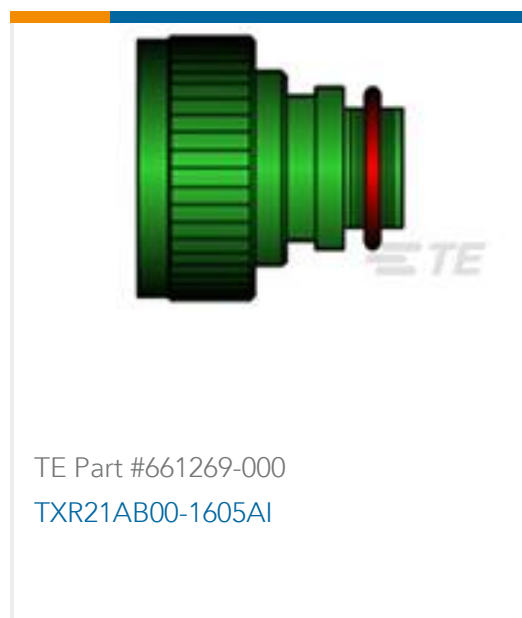
TE Part #661269-000 TXR21AB00-1605AI