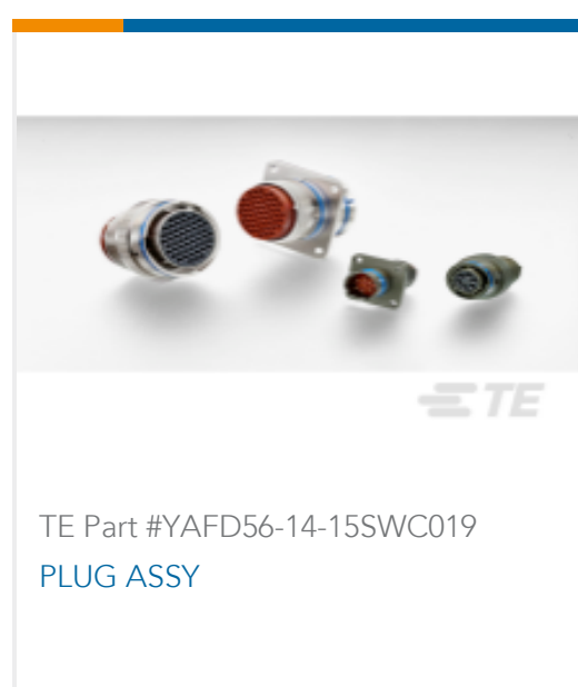
TE Part #YA56-14-15SWC019 PLUG ASSY