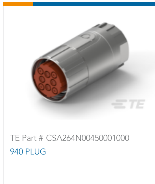
TE Part # CSA264N00450001000 940 PLUG