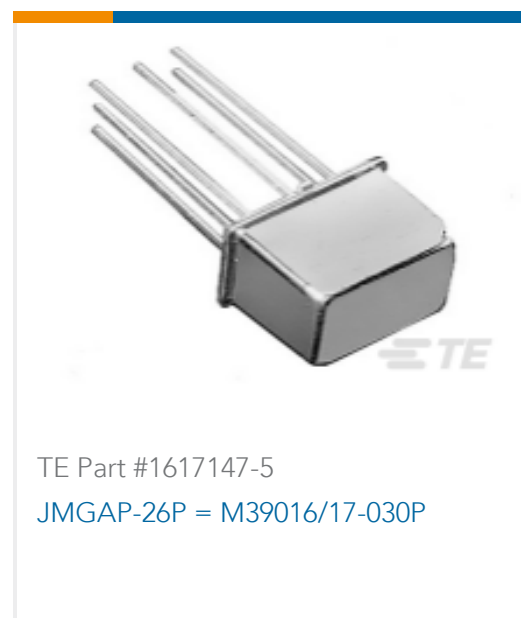
TE Part #1617147-5 JMGAP-26P = M39016/17-030P