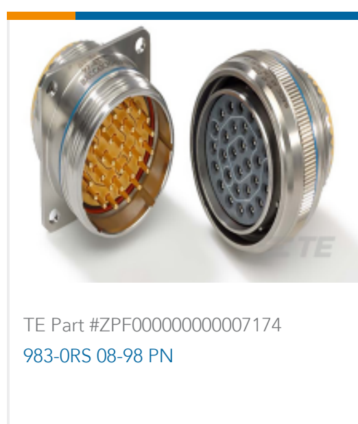
TE Part #ZPF00000000000007174 983-ORS 08-98 PN