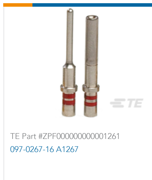
TE Part #ZPF0000000000001261 097-0267-16 A1267