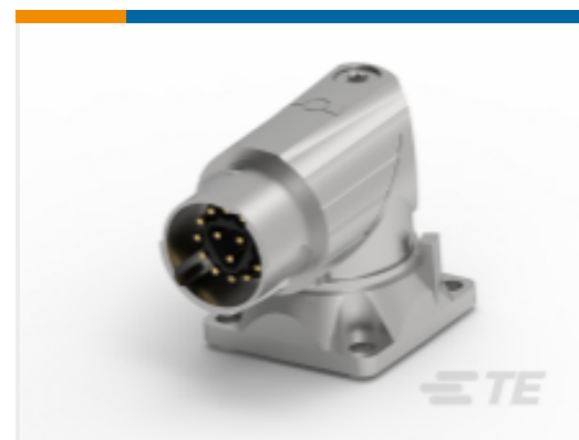
TE Part # EGC204N00000651000 615 itec receptacle angl rotatable 25x25