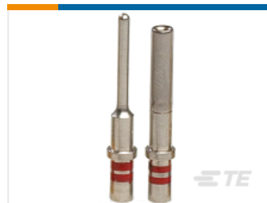
TE Part #ZPF000000000001261 097-0267-16 A1267