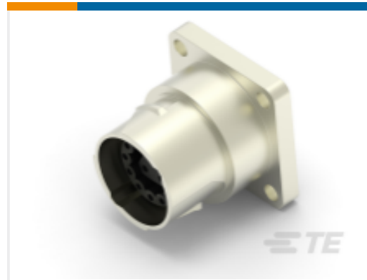
TE Part # EEA204N0000001000 915 ITEC RECEPTACLE