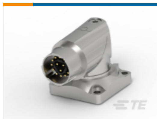
TE Part # EGA204N00000652000 615 itec receptacle angl rotatable 28x28