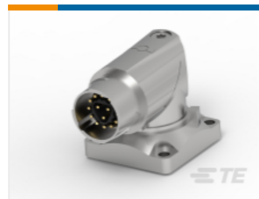
TE Part # EGC204N00000652000 615 itec receptacle angl rotatable 28x28