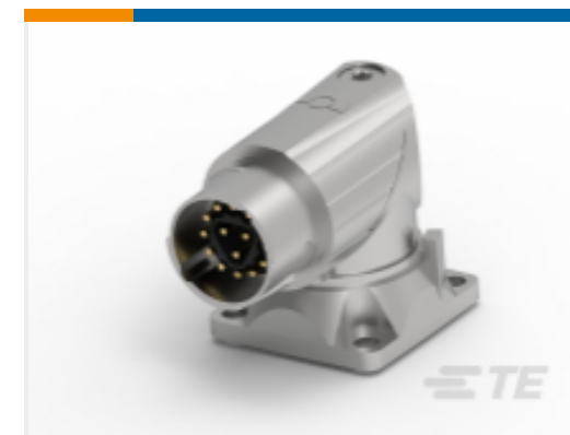
TE Part # EGA204N00000651000 615 itec receptacle angl rotatable 25x25