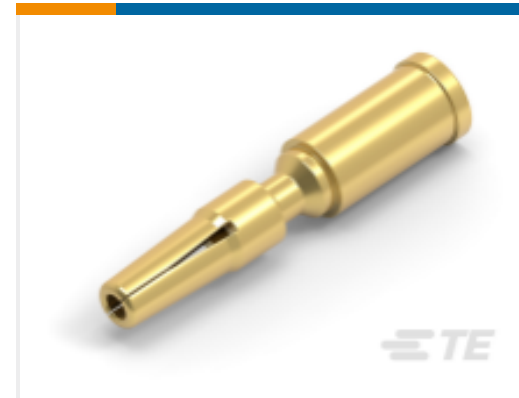
TE Part # 60-0251-011-000 CONTACT SOCKET 1 MM