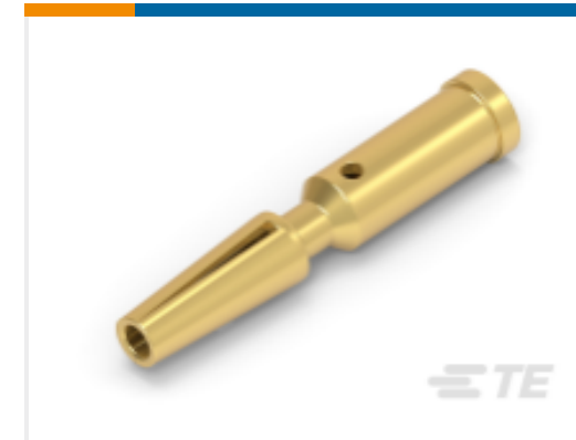
TE Part # 60-0252-011-000 CONTACT SOCKET 1 MM