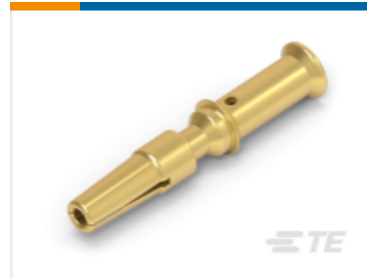
TE Part # 60-0265-011-000 CONTACT SOCKET 1 MM