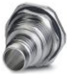
M8 pin, rear mounting

Housing screw connection - SACC-BP-M-M8/M12 SMD - 1412505