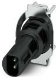
SPE PCB connector, type: IEC 63171-5, degree of protection: IP65/IP67, number of positions: 2, CAT B (ISO/IEC 63171), connection method: THR solder connection, Single Pair Ethernet

Please be informed that the data shown in this PDF Document is generated from our Online Catalog. Please find the complete data in the user's documentation. Our General Terms of Use for Downloads are valid ( http://phoenixcontact.com/download )