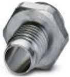
M8 pin, front mounting SMD with M10 screw fastening

Housing screw connection - SACC-FP-M-M8/M10 SMD - 1412502