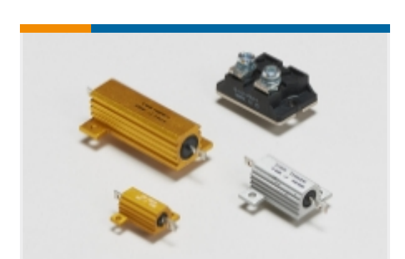
Chassis Mount Resistors(747)