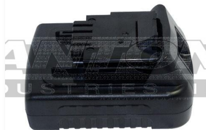
hover to zoom; click to enlarge

Chemistry: Lithium Ion (ICR/CGR/LIR) Voltage: 14.4 Capacity: 1500mAh (21.6Wh) Measurements: 3.9" x 3" x 1.7" 99.06mm x 76.20mm x 43.18mm