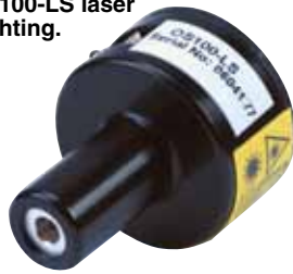
OS100-LS laser sighting.