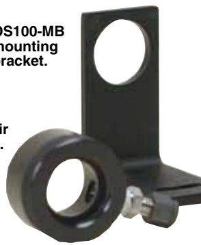
OS100-MB mounting bracket.