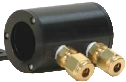
OS100-WC water cooling jacket.