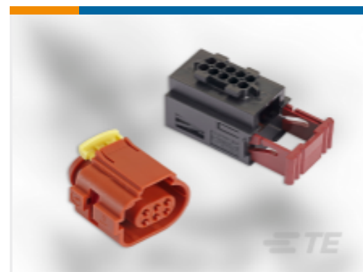
TE Part #1-967059-1 TIMER, CONNECTOR HOUSING