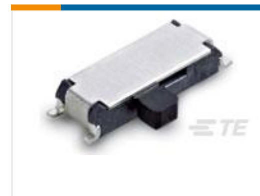
TE Part #1437575-1 MLL1200S=SPDT RA SMT SLIDE