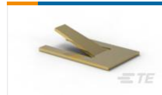
TE Part #1447009-5 SHIELD FINGER 0820 TYPE