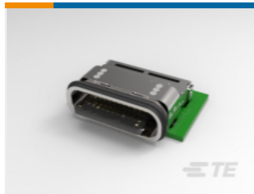
TE Part # 2305018-2 USB TYPE C, REC IPX8 ON BOARD DUAL SMT