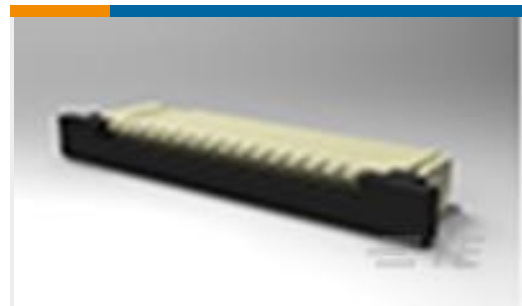
TE Part #1-84953-8 1MM FPC HORZ.TOP CONT.ASSY 18P