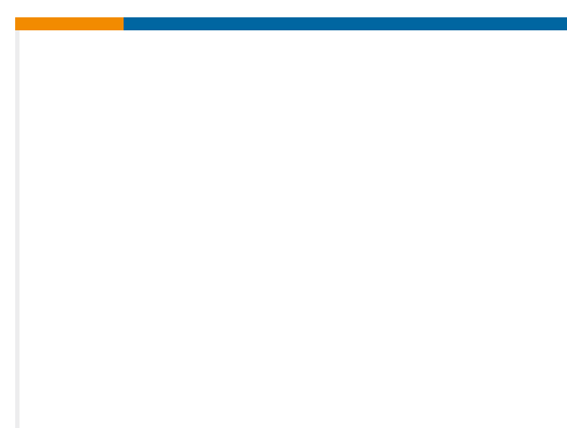
TE Part #G-NSPL2-005 NS-15/PL2-M ROHS