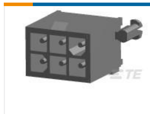
TE Part #1-770178-0 06P MINI-UMNL ASSY VO SNNI*