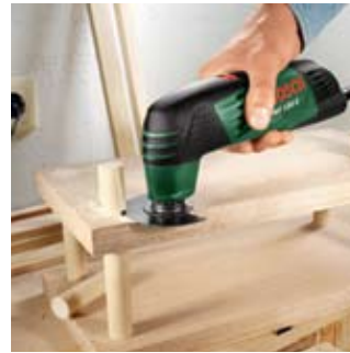
Flush cuts of wood.