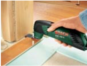
Shortening door frames.