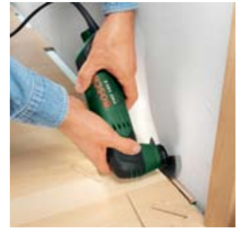
Sawing off parquet/laminate.