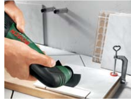
Cutting wall tiles.