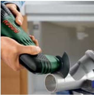
Cutting plastic pipes to length.

Whether short or long cuts, whether in the middle or at the very edge the PMF 180 E and the BiM segment saw blade enable you to work everywhere quickly and easily. Your flooring will be flush in no time, protruding wooden parts will be removed in a flash and the new drainpipe will be cut to the right length instantly. You will be able to do this effortlessly and with the highest degree of precision.