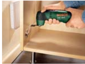
Cutouts in furniture.