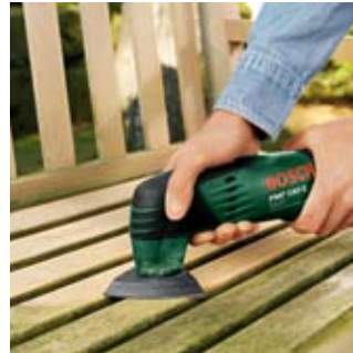
Evening out surfaces.