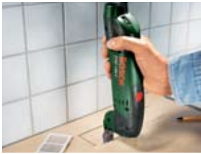
Cutouts in worktops.