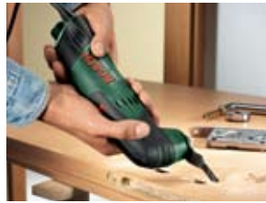
Trimming door fittings.