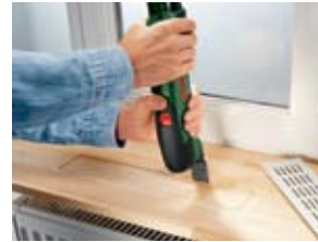
Cutouts in window sills.