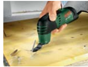
Cutting off nails.