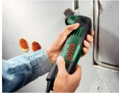
Makes grooves for cables.*

*can be used on materials plaster, pumice or aerated concrete stone