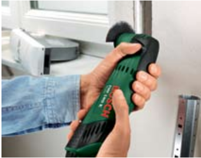
Cutting out wall openings.*

*can be used on materials plaster, pumice or aerated concrete stone