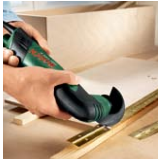
Cutting hinges to length.