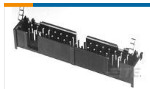
TE Part #1-1761606-6 IDC LOW PRO HDR 60P VERT LG LA ASSEMBLY