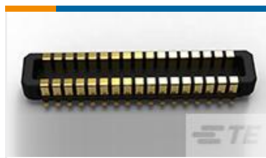
TE Part #1-2201196-0 0.4 STACKING CONN H0.98 PLUG ASSEMBLY