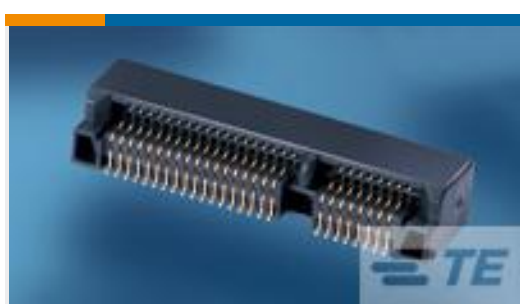
TE Part #1775838-2 mSATA/mini PCI-E 5.6H Type I G/F