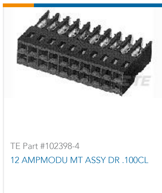
TE Part #102398-4 12 AMPMODU MT ASSY DR .100CL