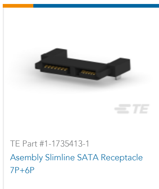
TE Part #1-1735413-1 Assembly Slimline SATA Receptacle 7P+6P