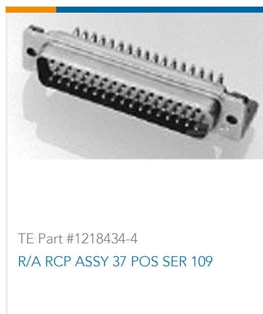
TE Part #1218434-4 R/A RCP ASSY 37 POS SER 109