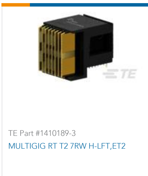
TE Part #1410189-3 MULTIGIG RT T2 7RW H-LFT,ET2