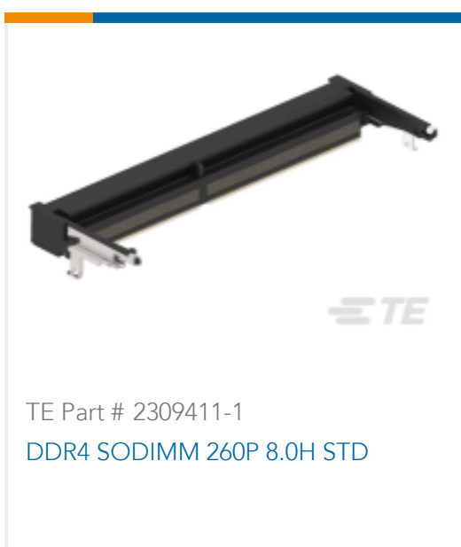
TE Part # 2309411-1 DDR4 SODIMM 260P 8.0H STD