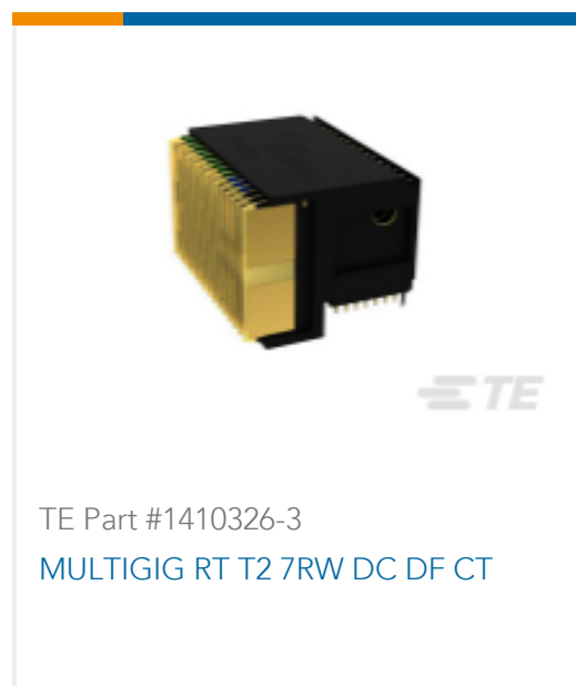
TE Part #1410326-3 MULTIGIG RT T2 7RW DC DF CT