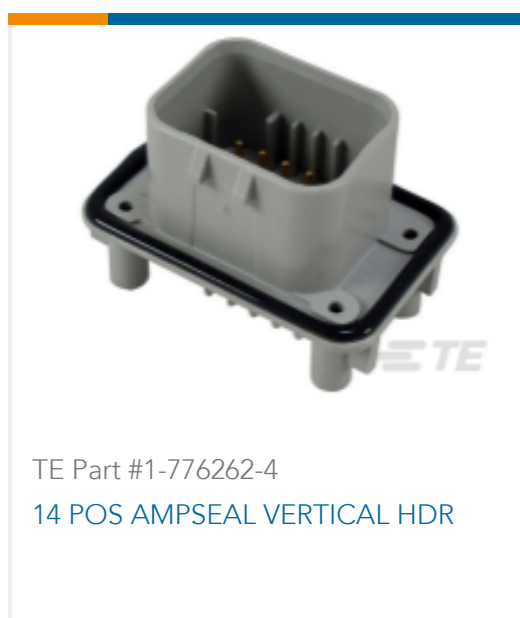
TE Part #1-776262-4 14 POS AMPSEAL VERTICAL HDR