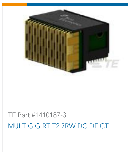
TE Part #1410187-3 MULTIGIG RT T2 7RW DC DF CT