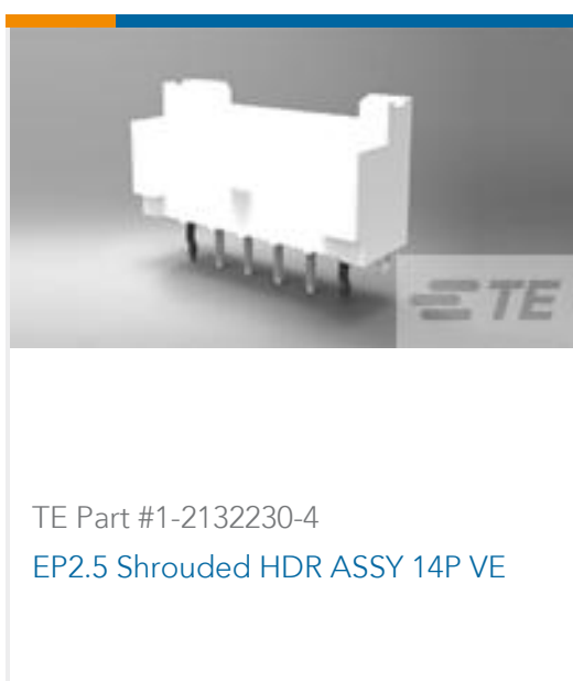
TE Part #1-2132230-4 EP2.5 Shrouded HDR ASSY 14P VE