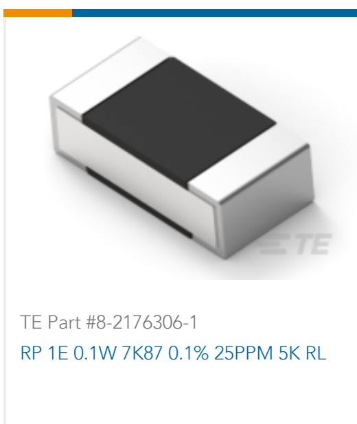
TE Part #8-2176306-1 RP 1E 0.1W 7K87 0.1% 25PPM 5K RL