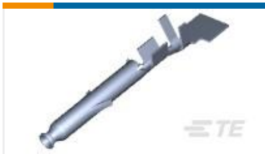
TE Part #1-770902-0 MINI UMNL SOK 26-22 AWG AU