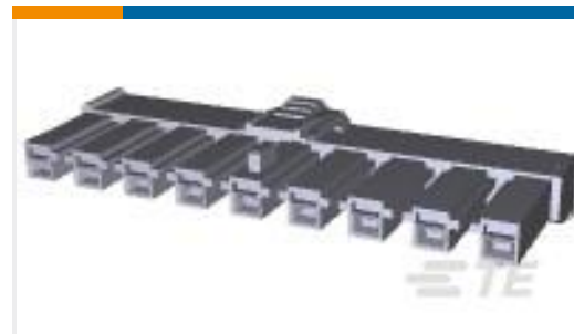
TE Part #9-178842-1 AMP U/P SGL ROW PLUG HSG 9P