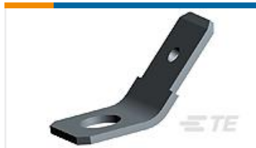
TE Part #140759 250 FASTON,TAB,TPBR