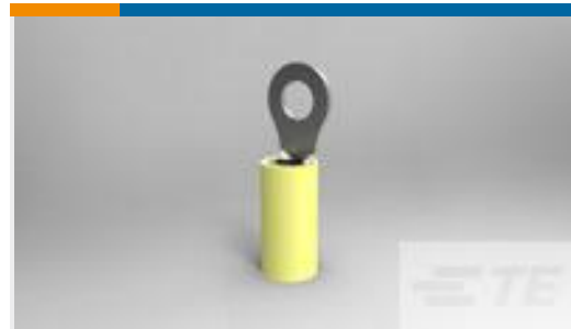
TE Part #2-35109-1 PIDG 12-10 R 10; TAPE