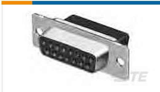
TE Part #1658644-1 HDP-20,RCPT,SIZE 2, 15 POSN,CL