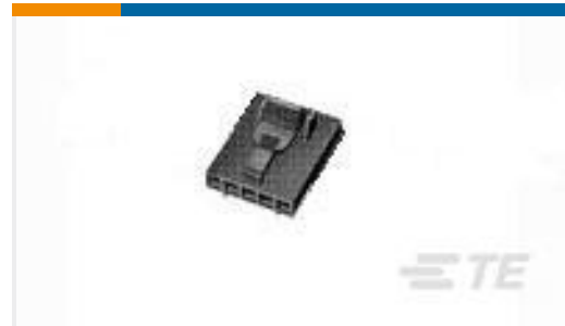
TE Part #104257-6 07 MTE RCPT HSG SR LATCH .100