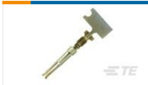
TE Part #1658543-2 SOCKET CONT DUPL PLT STRIP HD-