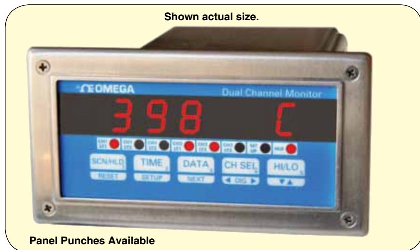
Panel Punches Available

The DP3300 comprises highly versatile dual-input meters that can monitor either 2 analog inputs or an analog input and a pulse input. On the analog channel, signals from thermocouples, RTDs, or thermistors are linearized and displayed in °C or °F. Voltage, current and millivolt inputs can be easily scaled. The pulse input on both channels can function as an up/down counter or as a rate, rpm, or frequency monitor. Scaling can easily be performed on the front-panel keypad (e.g., pulses from a flowmeter can yield the flow rate).