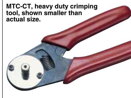
MTC-CT, heavy duty crimping tool, shown smaller than actual size.