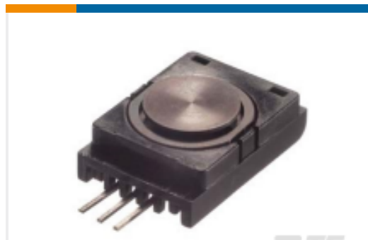
TE Part #FS2030-000X-0500-G FS2030 500G FORCE SENSOR