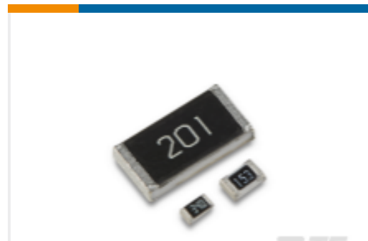
TE Part #4-2176326-3 CRGP 0603 33K 1%