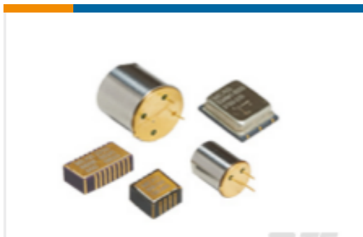
TE Part #3038-6000 Embedded Accelerometer STOCK LIST