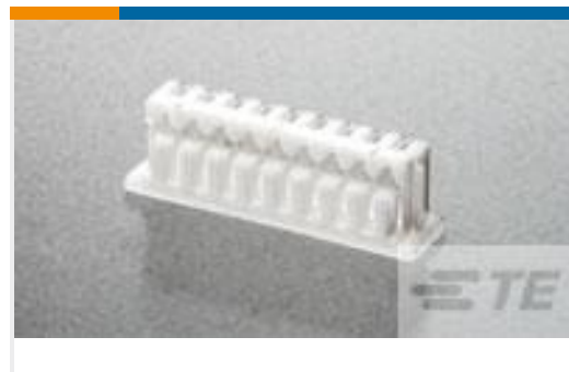
TE Part #1-440146-2 1.25mm WTB Socket,Housing,12p