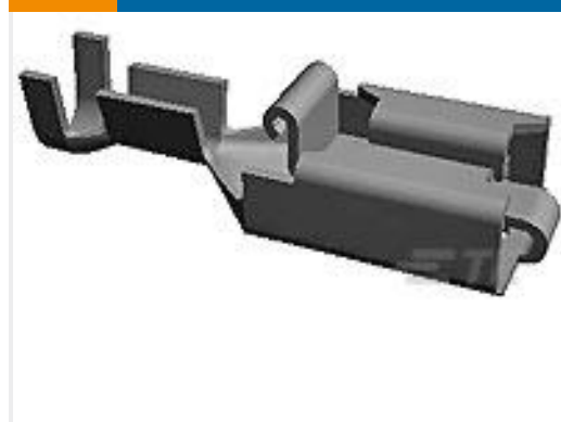
TE Part #154717-6 PL 250 REC TERMINAL 14-11 AWG PTPB