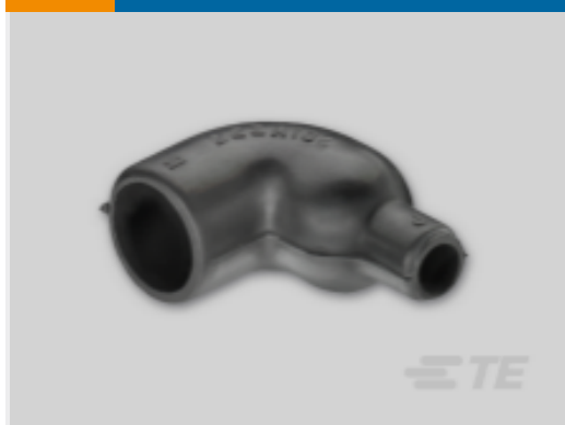
TE Part #878513-000 Bulbous Heat Shrink Boots: Lipped, Right Angle