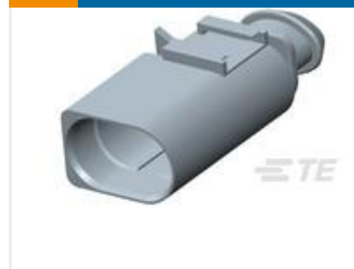
TE Part #1-1703543-0 2POS,TAB 2.8X0.8,TAB HSG,ASSY