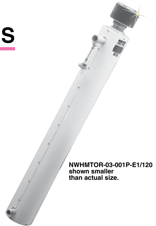
NWHMTOR-03-001P-E1/120 shown smaller than actual size.

Note — Add 2" to A dimension for E2 Enclosure.