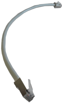
Cat6, RJ45 Plug to RJ45 Plug L=305mm