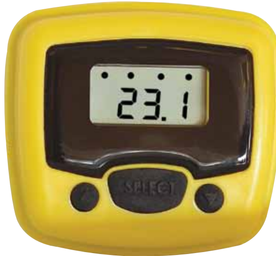
LVCN-40 shown smaller than actual size.

The LVCN-40 indicator displays tank level or volume in engineering units with 1 to 4 relay status indicators, and is compatible with LVCN210, LVCN318 or LVCN414 series level sensor that's been configured with the provided software (V50 firmware or higher). Powered by the sensor, the field mount indicator may be located up to 4.5 m (15') from the sensor.