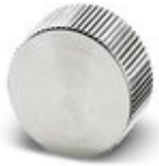
Metal protection cap for signal connectors with M23 external thread

Metal protective cap - RC-Z2104 - 1604260