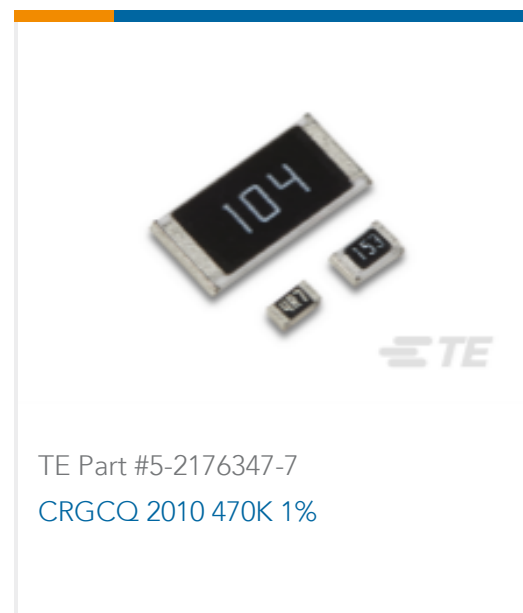
TE Part #5-2176347-7 CRGCQ 2010 470K 1%