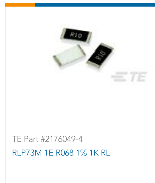
TE Part #2176049-4 RLP73M 1E R068 1% 1K RL