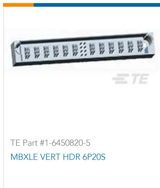
TE Part #1-6450820-5 MBXLE VERT HDR 6P20S