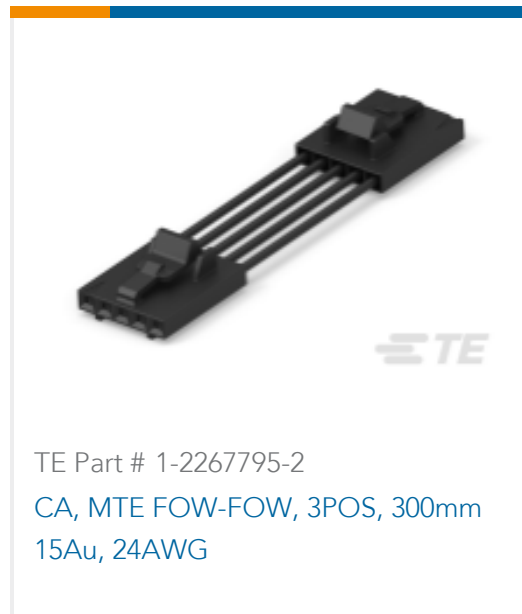
TE Part # 1-2267795-2 CA, MTE FOW-FOW, 3POS, 300mm 15Au, 24AWG