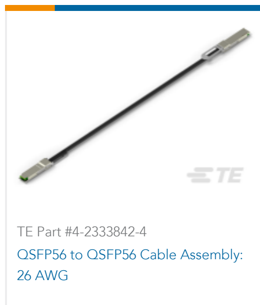
TE Part #4-2333842-4 QSFP56 to QSFP56 Cable Assembly: 26 AWG