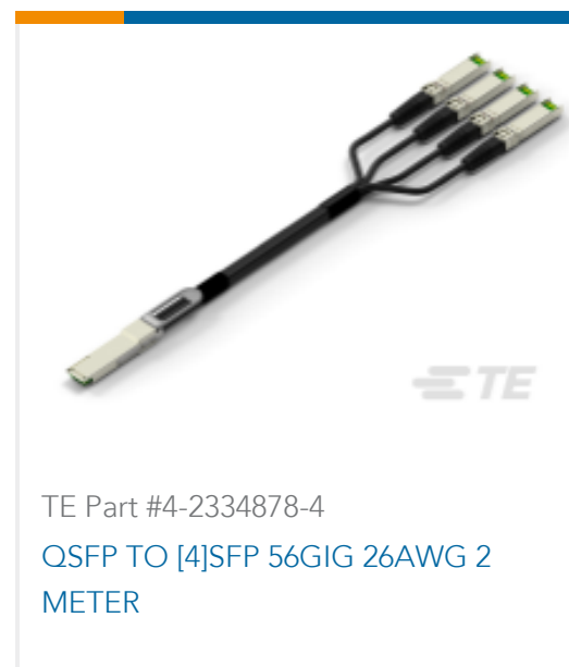
TE Part #4-2334878-4 QSFP TO [4]SFP 56GIG 26AWG 2 METER