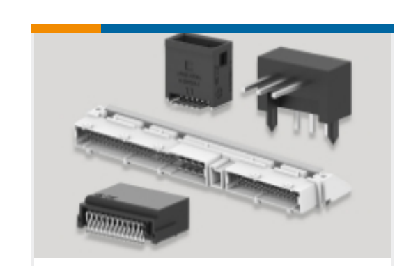
PCB Headers & Receptacles(362)