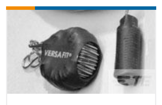
TE Part #938365P002 VERSAFIT-1/8-0-0.75IN-ST