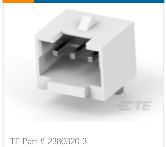
1.5P 3POS WTB VERT BRD W LATCH TIN NAT