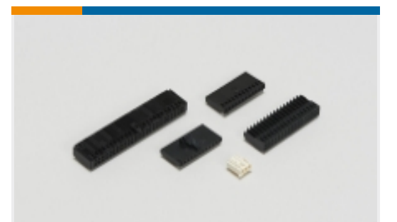
Wire-to-Board Connector Assemblies & Housings(139)