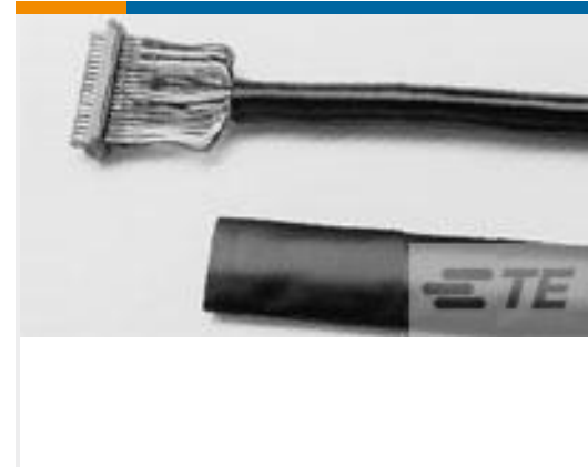
TE Part #530219P009 RNF-150-1/4-0-1.25IN