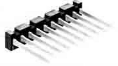
TE Part #87113-4 04 MODI HDR SRST .156CL