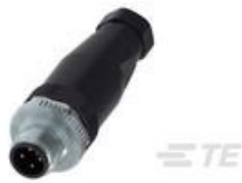
TE Part #6-2271110-2 M12, MALE, A CODE, 12P, PG9 (AU)