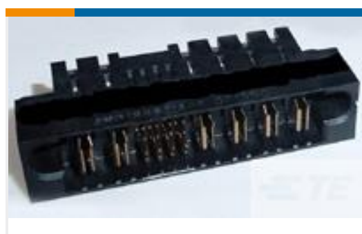
TE Part #1892301-1 MBXL R/A HDR DB 12S+11P