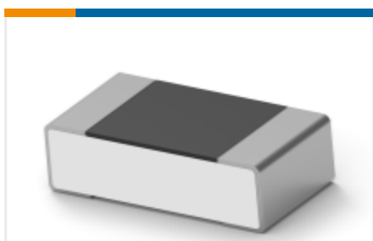
TE Part #9-2176371-6 RQ 0603 45K3 0.1% 10PPM 5K RL