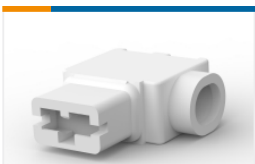
TE Part #368601-1 POSITIVE LOCK EX 187 HOUSING REC