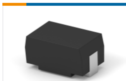
TE Part #7-1879233-8 SMD Power Resistor: 7 Watt, 200-2M Ohm