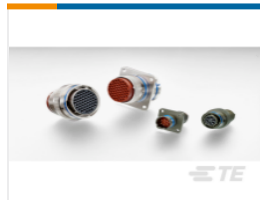
TE Part #YAFD57-22-55PNC012 PLUG ASSY