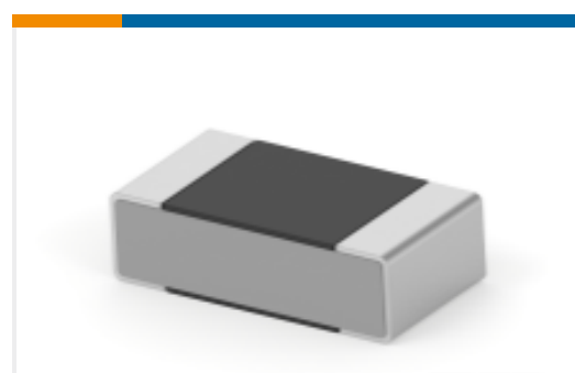
TE Part #4-1879207-5 RN 0603 442K 0.1% 10PPM 1K RL