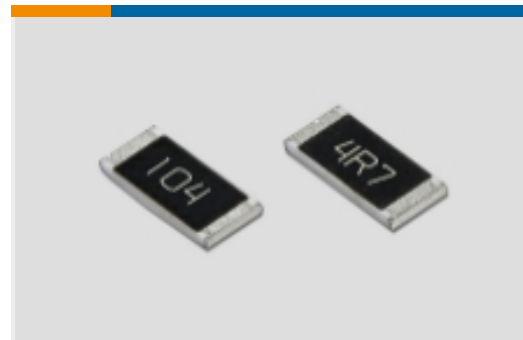
Surface Mount Resistors(35)