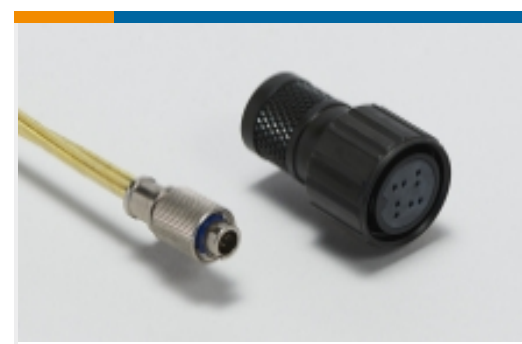
Standard Circular Connectors(8)