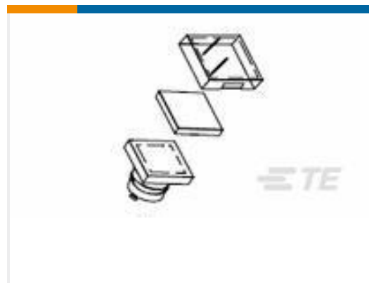
TE Part #7-1437569-9 64S2=COLOR PB CAP RED SQ