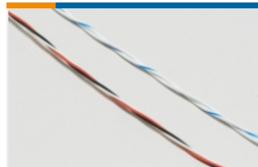
Twisted Pair Cable(1)