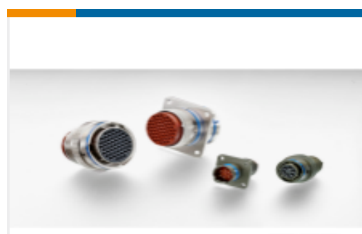
TE Part #YAFD57-22-55SNC012 PLUG ASSY